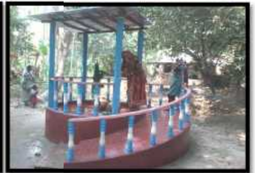
Lifting Platform with Tube well