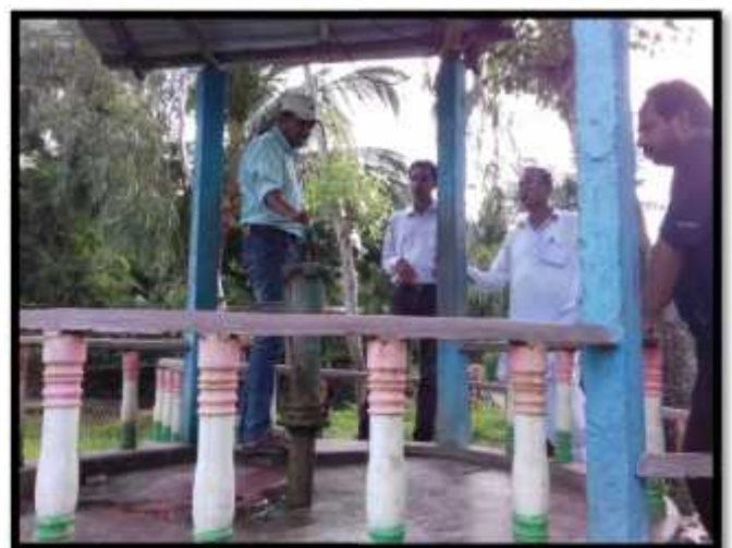
Monitoring visit with GP authority