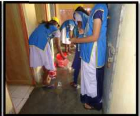
Cleaning of toilet block