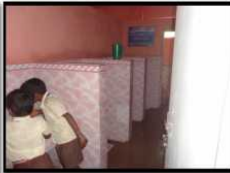
School Toilet Block