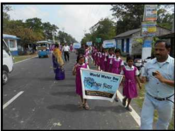
Observation of World Water Day