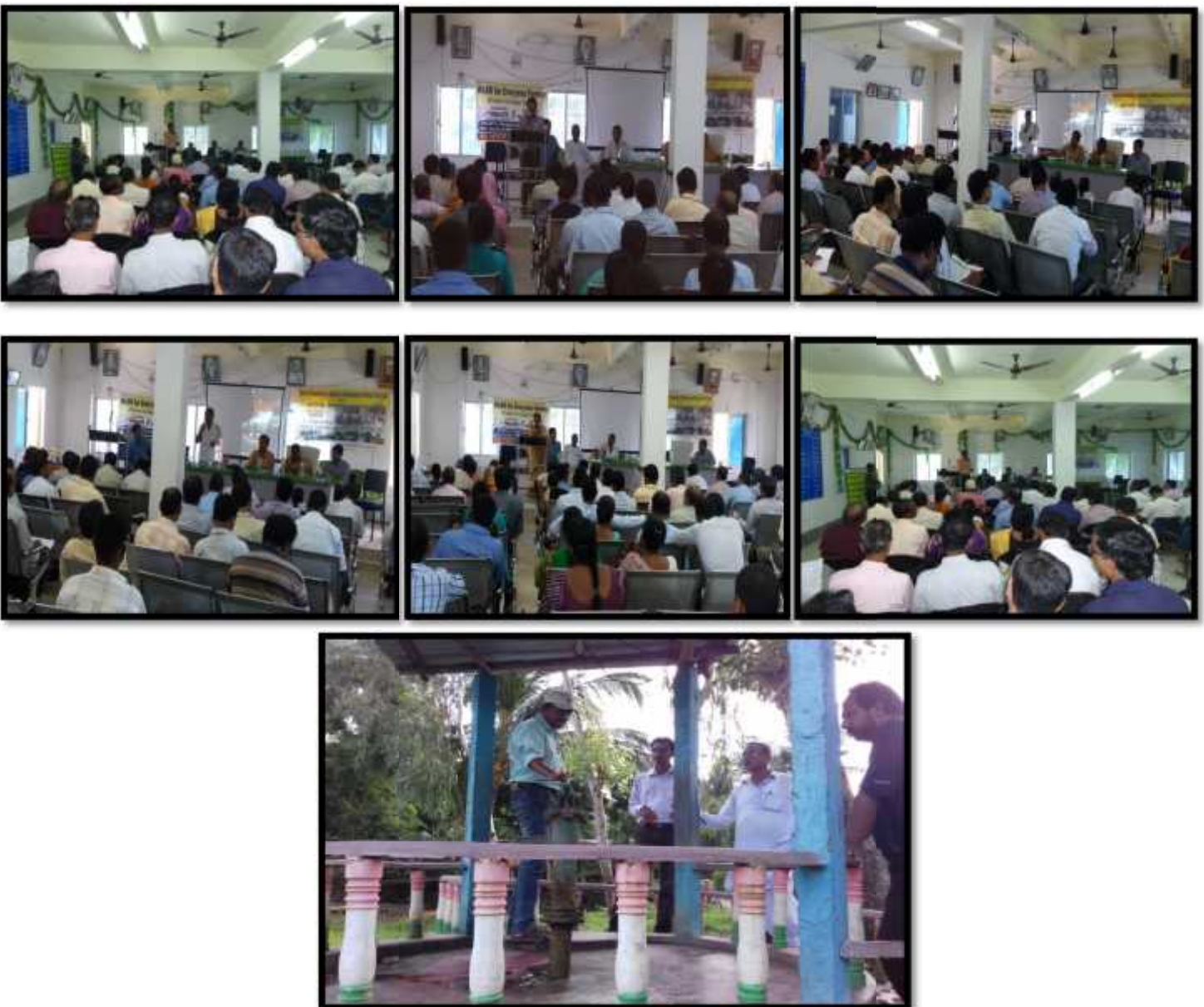
Monitoring visit by block authority