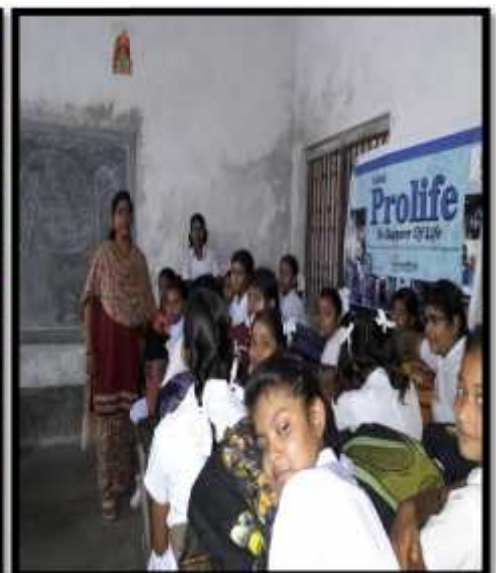
Menstrual hygiene class