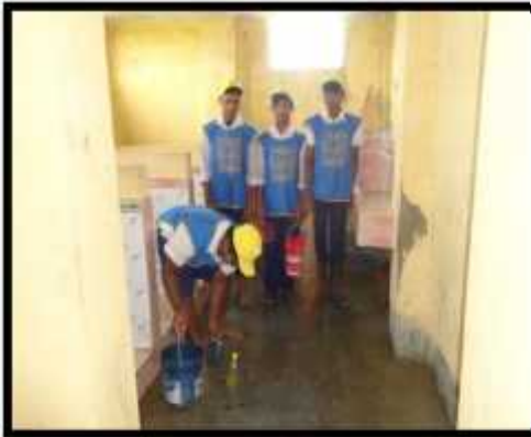
Cleaning of toilet block