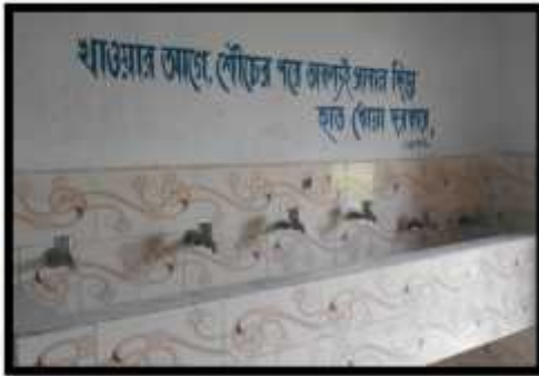
Drinking Water Station