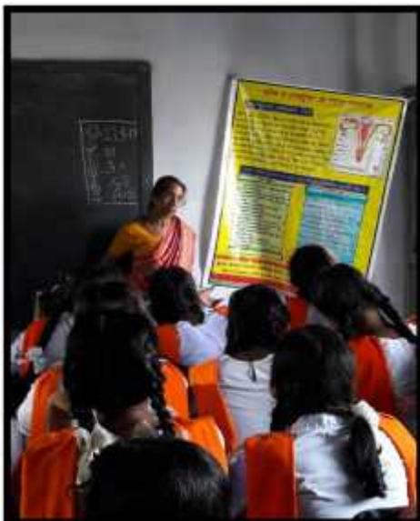
Menstrual hygiene class

The teachers, student and their parent were happy and it is observed that absenteeism is remarkably reduced after opening the facilities for use.